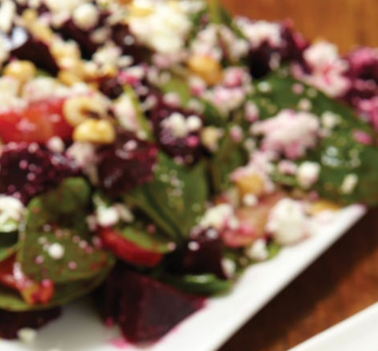
Beetroot, Baby Spinach and Hazelnut Salad