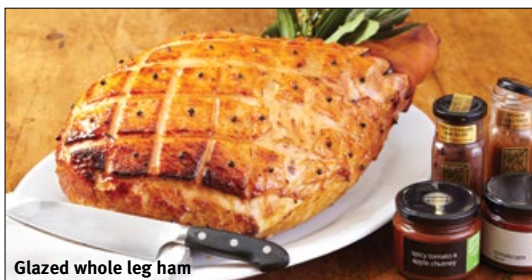
Glazed whole leg ham

A NON-REFUNDABLE DEPOSIT OF $50.00 IS REQUIRED WITH ALL TURKEY & HAM ORDERS. WE HAVE A LIMITED NUMBER OF EACH SIZE. PLEASE ORDER EARLY TO AVOID MISSING OUT.