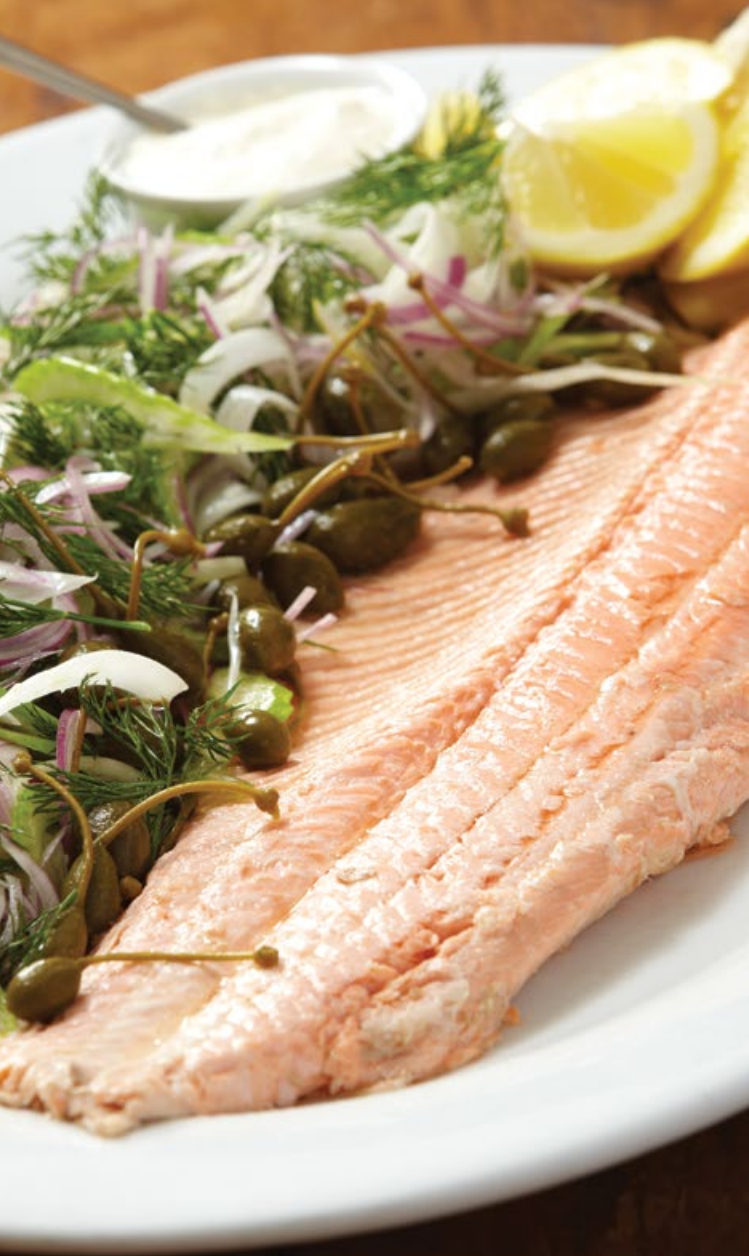
Roasted Ocean Trout Fillet