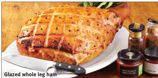
Glazed whole leg ham